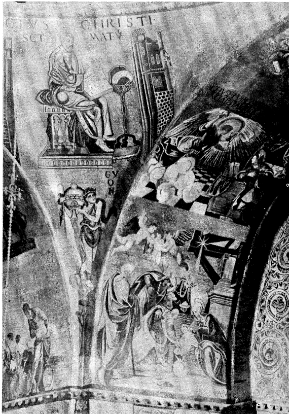
FIGURE 1. One of the four spandrels of St Mark's; seated evangelist above, personification of river below.

The design is so elaborate, harmonious and purposeful that we are tempted to view it as the starting point of any analysis, as the cause in some sense of the surrounding architecture. But this would invert the proper path of analysis. The