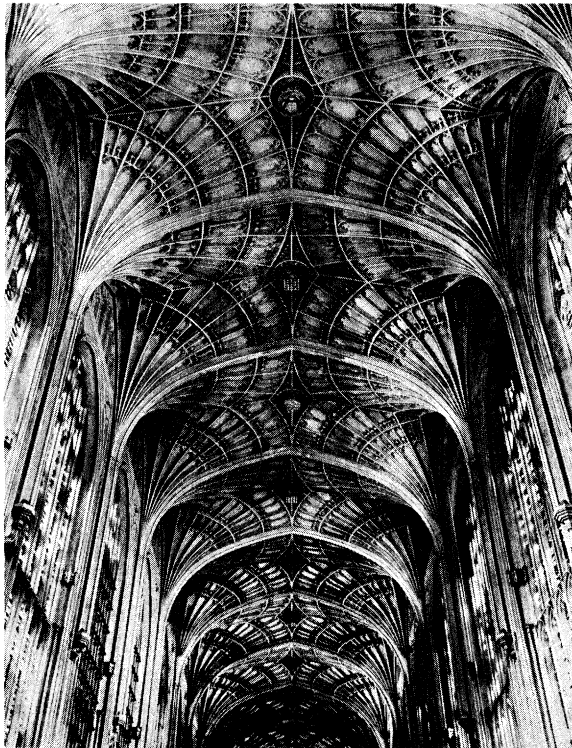
FIGURE 2. The ceiling of King's College Chapel.

the Tudor rose and portcullis. In a sense, this design represents an ‘adaptation’, but the architectural constraint is clearly primary. The spaces arise as a necessary by-product of fan vaulting; their appropriate use is a secondary effect. Anyone who tried to argue that the structure exists because the alternation of rose and portcullis makes so much sense in a Tudor chapel would be inviting the same ridicule that Voltaire heaped on Dr Pangloss: ‘Things cannot be other than they