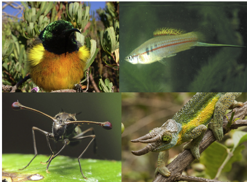
Figure 1. Examples of conspicuous sexually selected characters.

The solution to this apparent paradox is that the variance in male reproductive success is typically very large, meaning that sexual selection can be strong. It is important to remember that the variance in reproductive success is a measure of the potential for sexual selection and need not imply that any selection is occurring — the variance in sexual fitness may be random with respect to trait values, which of course means no selection. To establish a trait is subject to sexual selection, a clear link between it and mating success needs to be made (see below). Nonetheless, potential and realized selection on male traits is often very strong, with many male characters subject to sexual selection. This includes male body size, display rate or display size, and is why male mammals are often larger than females, for example.